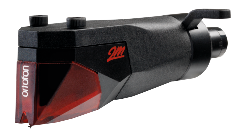
2M PnP is designed for direct mount on s-shaped arms with universal mount. 2M PnP provides correct Baerwald alignment with the majority of tonearms with universal mount.