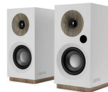
S-801PM POWERED SPEAKERS